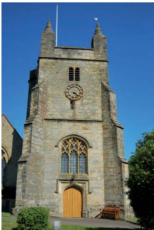
Fig. 3. Bolney tower, west face.