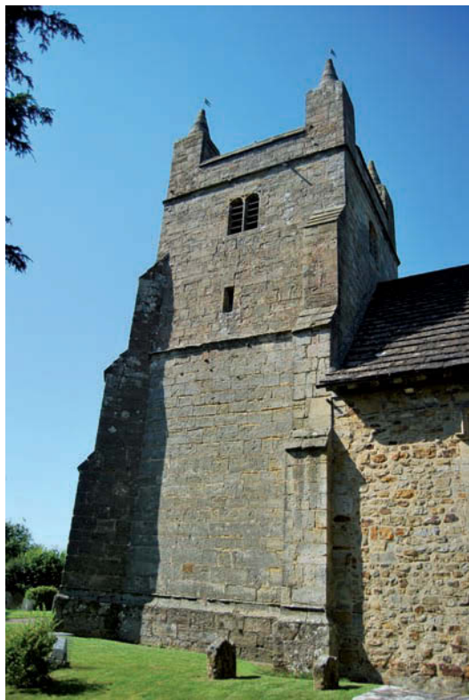
Fig. 4. Bolney tower, north face.