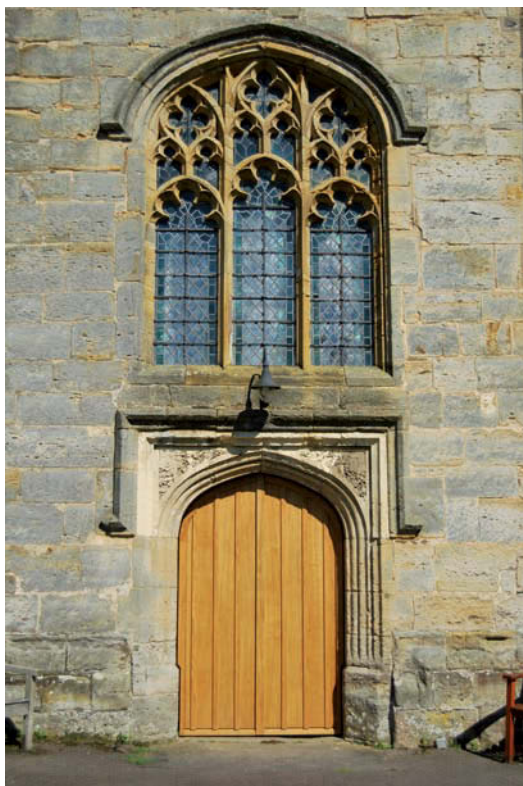
Fig. 6. West door and window.