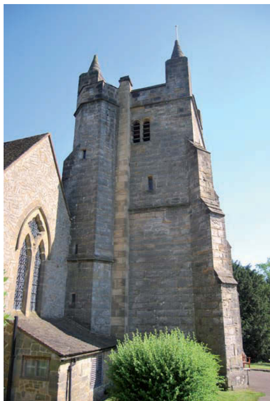
Fig. 2. Bolney tower, south face.