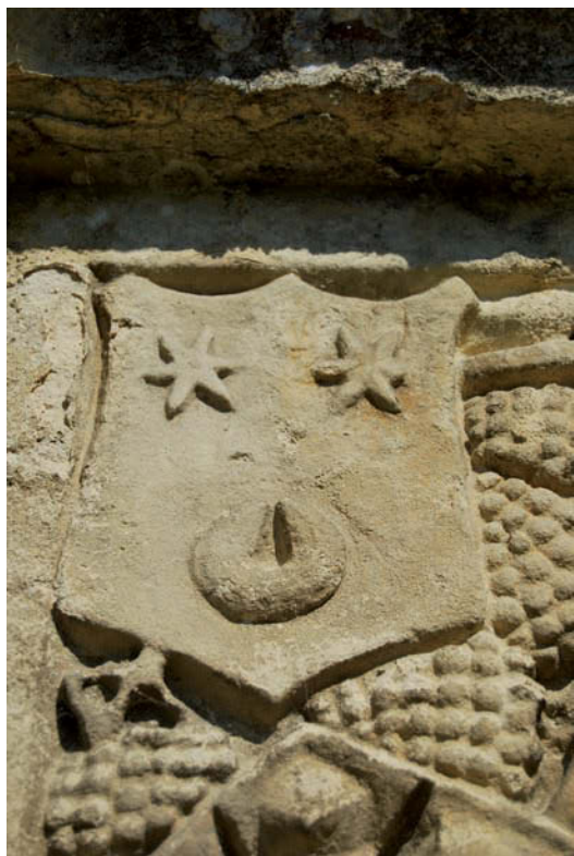
Fig. 7. Bolney arms in left spandrel.